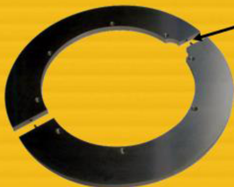
Precision-split Wear Plate with locating pins.