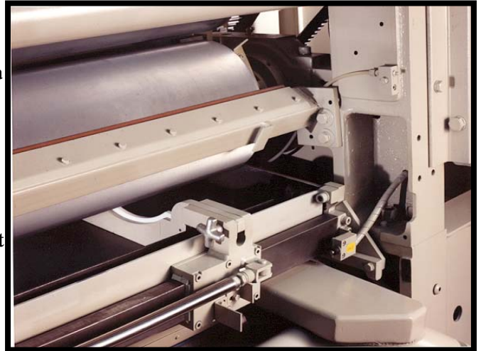
VIEW SHOWING A DAM WITH THE PAN LOWERED

At SUN Automation Group, we're always looking for new ways to improve your Langston Corrugating Machinery.